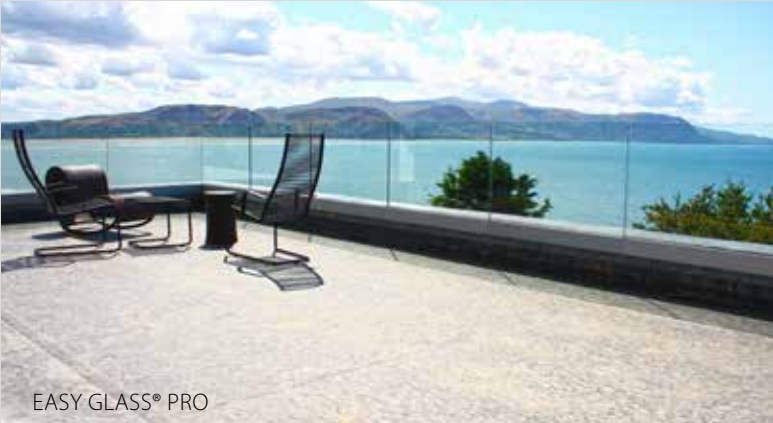
EASY GLASS® PRO

DUO LINE 20 QUICKRAIL® 22 LINEAR LINE 24 SQUARE LINE® 26 Q-LINE 28 ULTRA RANGE 30