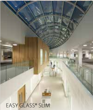
EASY GLASS® SLIM