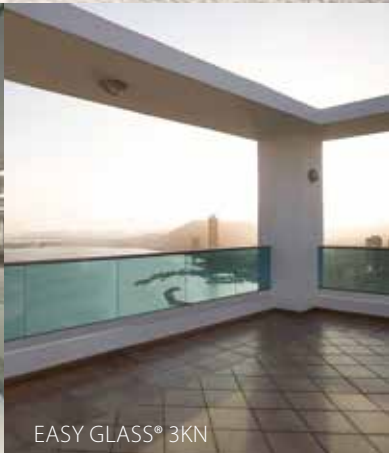
EASY GLASS® 3KN